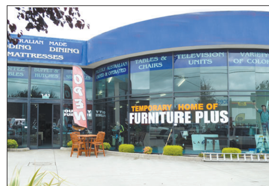
Furniture Plus has relocated temporarily to 141 Queen St (opposite Supercheap Auto). Call in and say hello.

To kick off the new year, Furniture Plus are having a massive Sealy Mattress Sale with 30% off and free local delivery.